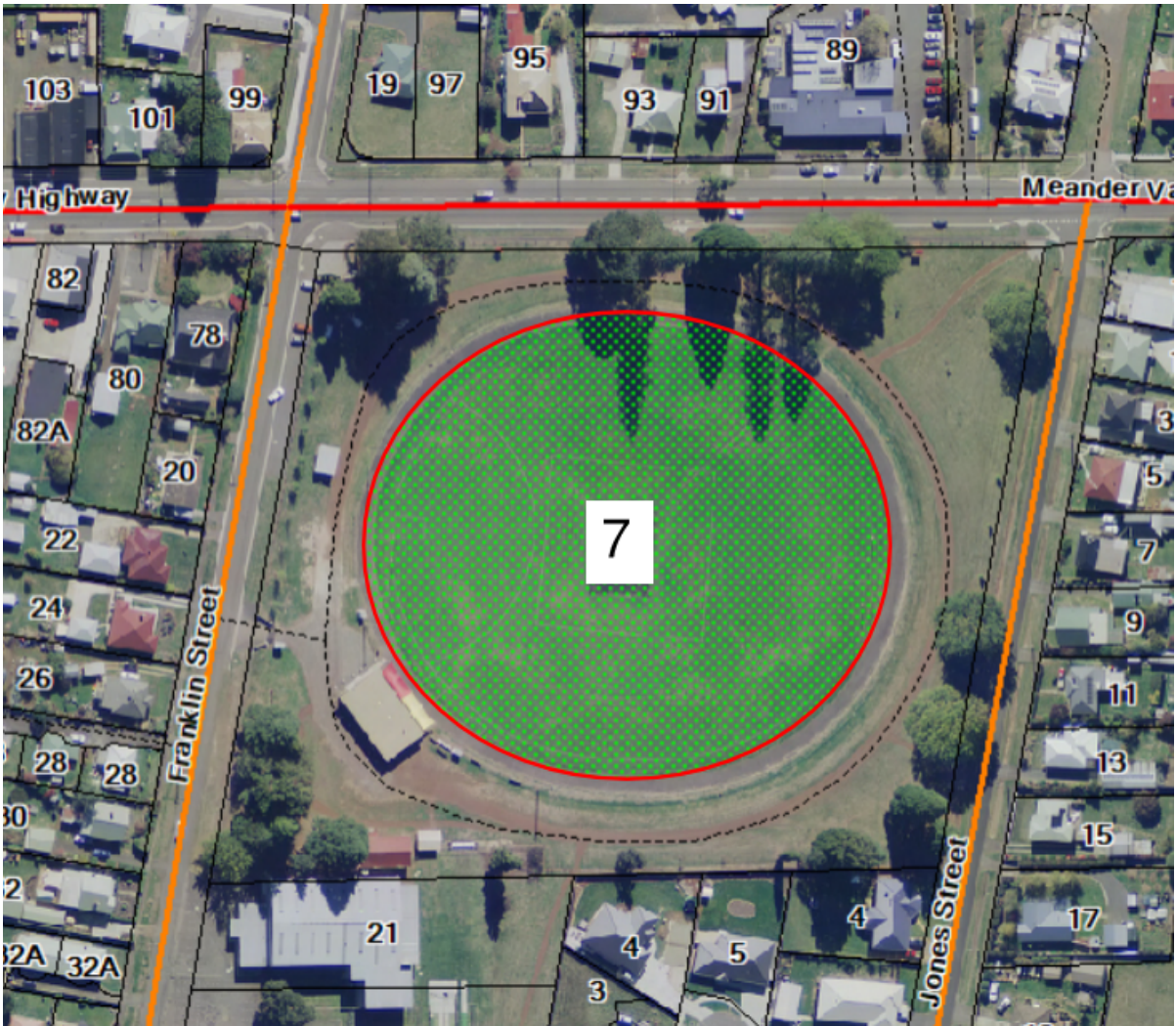
Map 7: Location 7 – Westbury Recreation Ground, Franklin Street, Westbury – playing surface of sportsground – dogs restricted from entering at all times - proposed.