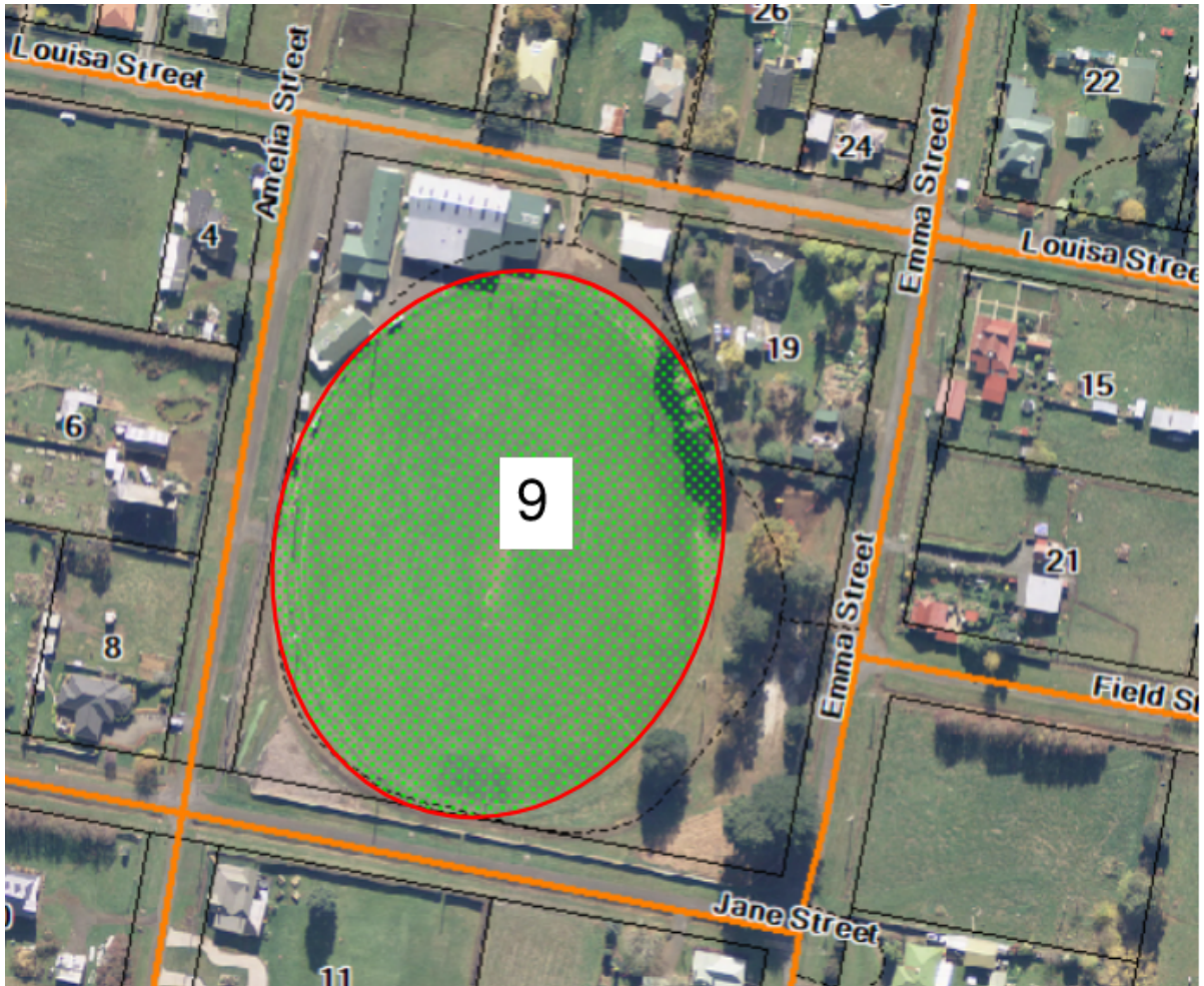
Map 9: Location 9 – Bracknell Recreation Ground, Louisa Street, Bracknell – playing surface of sportsground – dogs restricted from entering at all times - proposed.