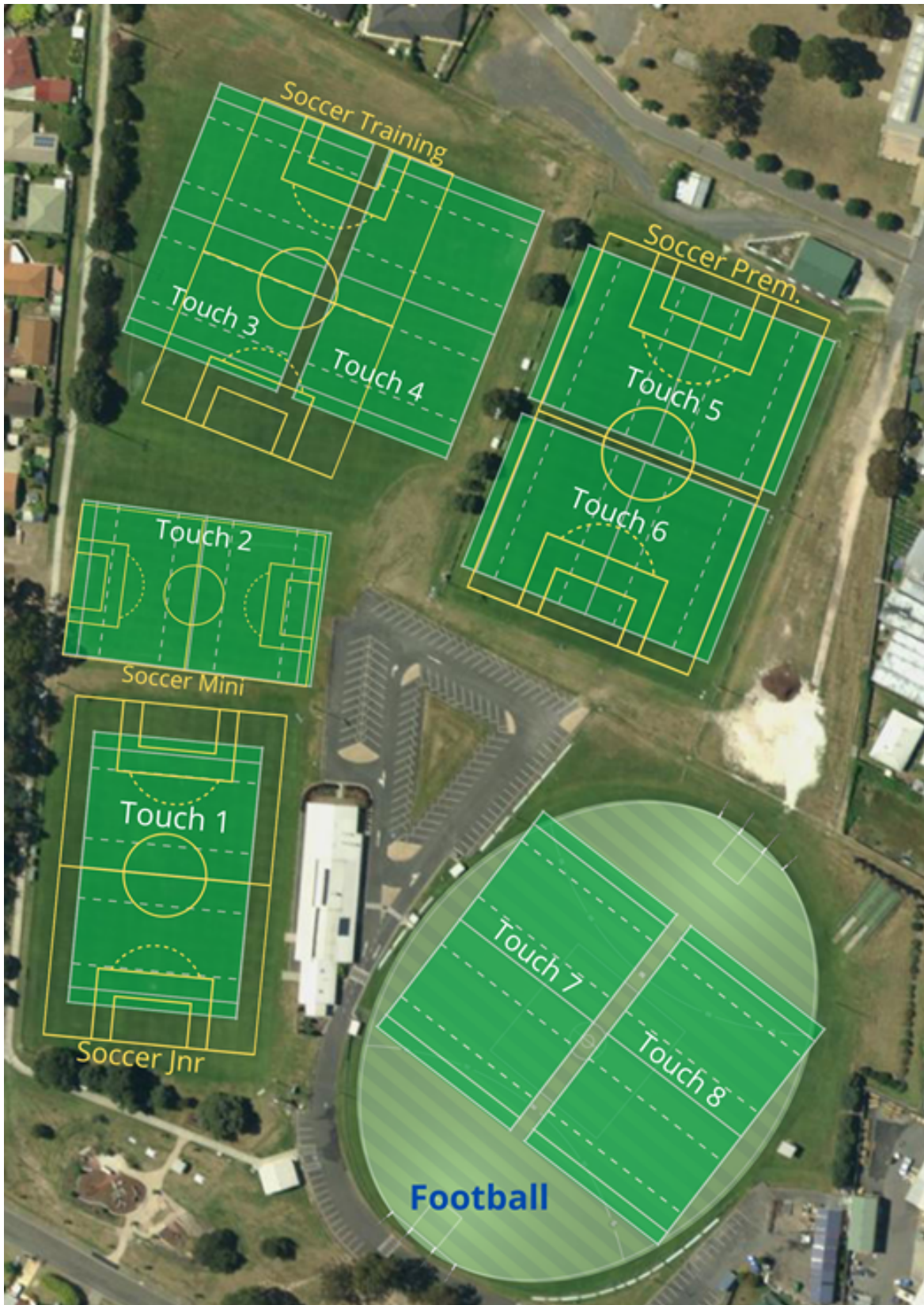
Map 6: Prospect Vale Park, Harley Parade, Prospect Vale – playing surface of sportsgrounds – dogs restricted from entering at all times - proposed.