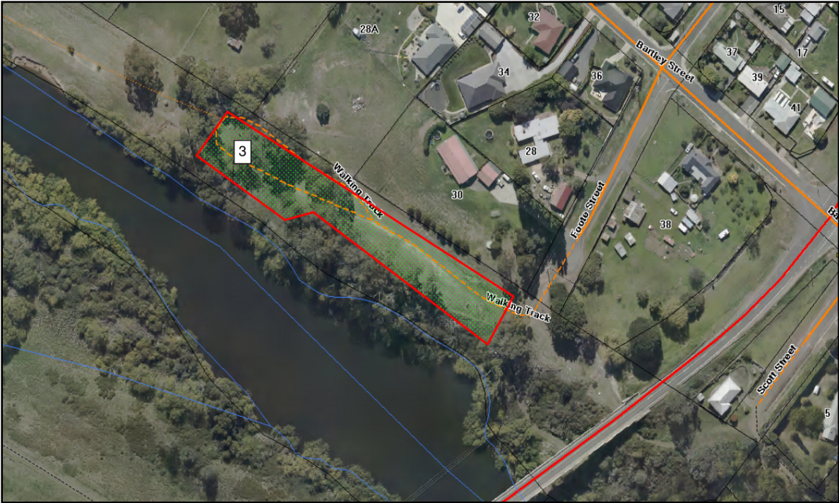
Map 3: Location 3 – River Reserve, between Foote Street and Browne Street, Hadspen.