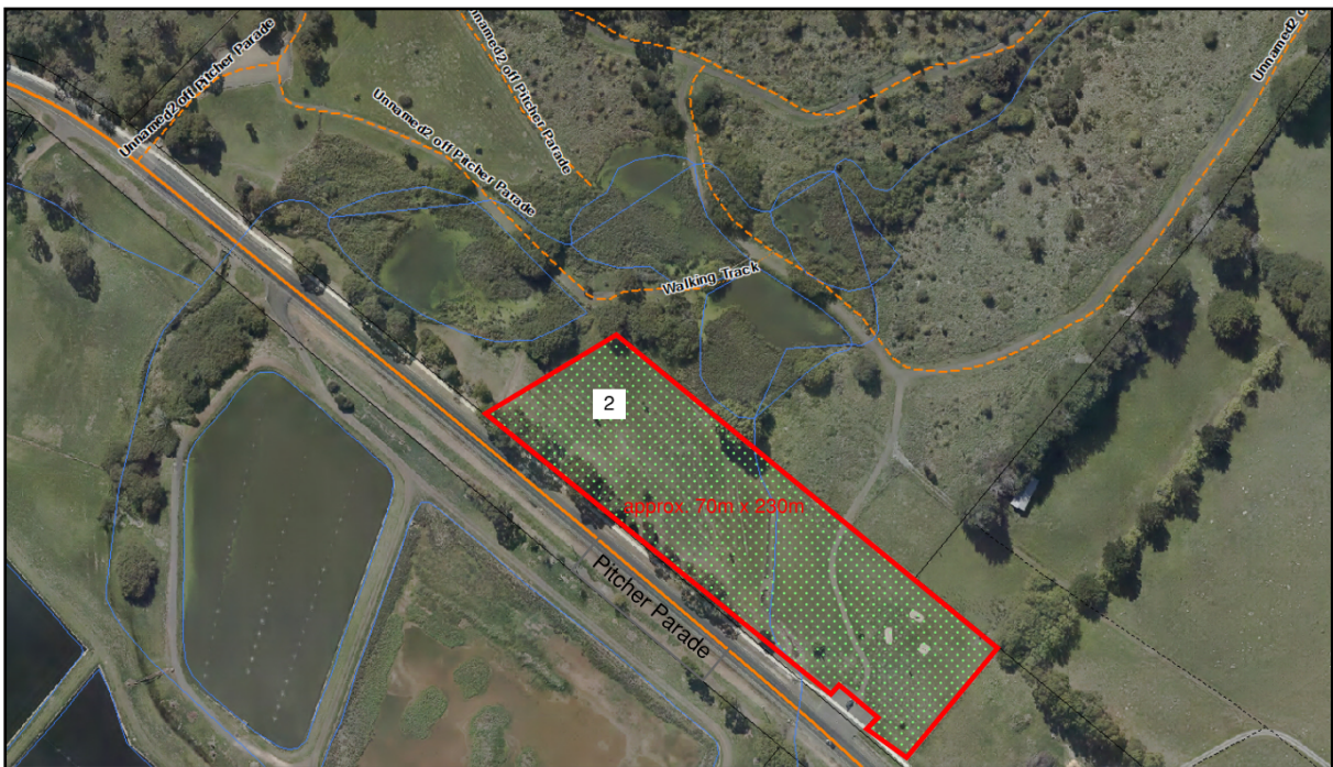
Map 2: Location 2 – Pitcher Parade, Prospect Vale (to the east of Wetlands area) - fenced.