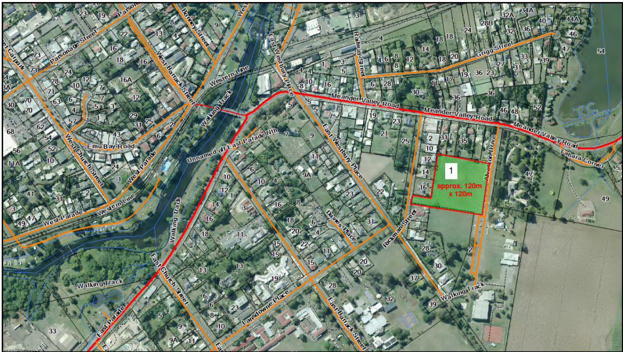
Map 1: Location 1 – Alveston Drive, Deloraine (part of Deloraine Community Complex site) - fenced. Also accessed from Rickman Street, Deloraine.