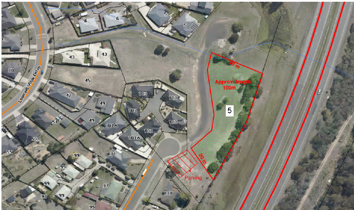
Map 5: Location 5 – Prospect Vale, Lomond Views Private Open Space, off Chris Street, Prospect Vale – Proposed fenced dog exercise/training area.