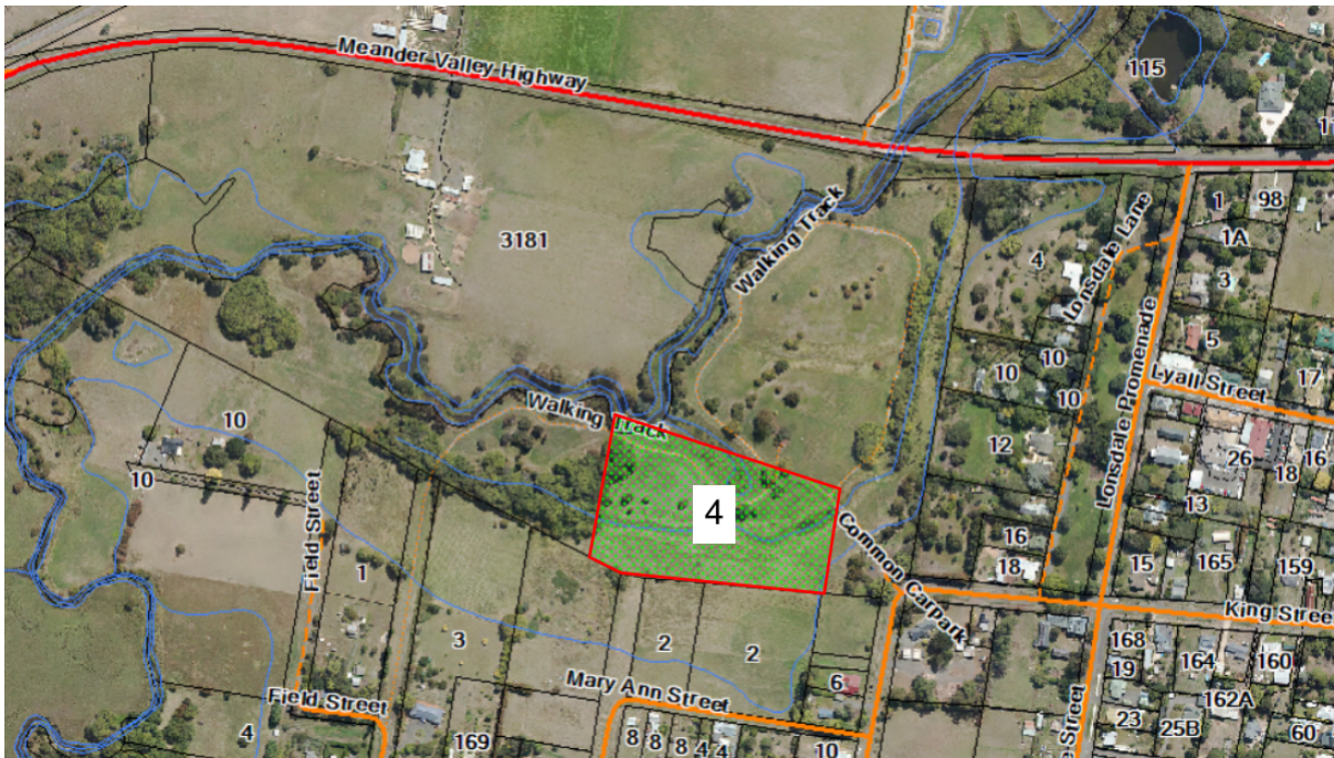
Map 4: Location 4 – Westbury Town Common, Mary Street, Westbury.