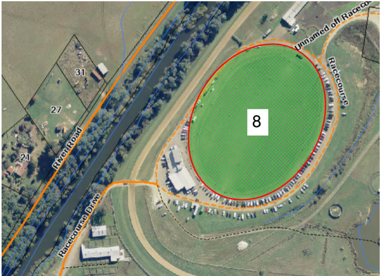
Map 8: Location 8 - Deloraine Recreation Ground, Racecourse Drive, Deloraine – playing surface of sportsground – dogs restricted from entering at all times - proposed.